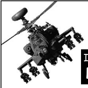
IDAHO ARMY GUARD HELICOPTER

(No charges or fees. Liability & photo release required of all participants. See reverse.)